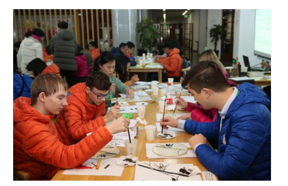
Hehuan fan painting

Chinese cultural experience and various visits.