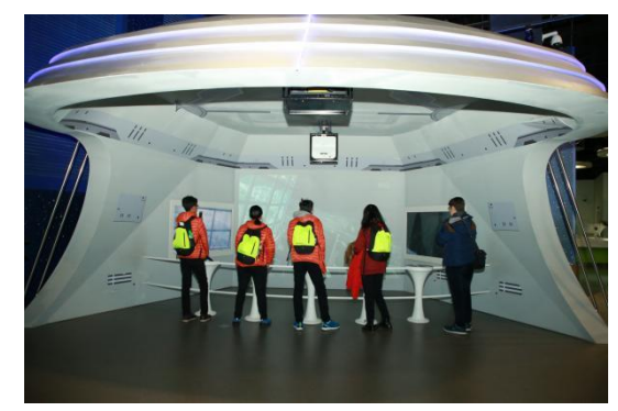
Visiting China Science and Technology Museum