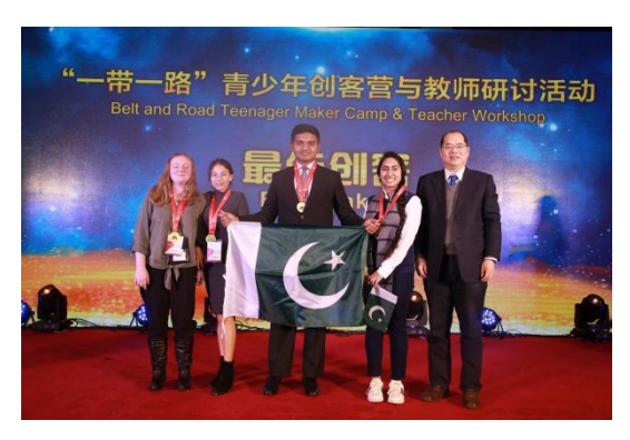
Farewell Banquet & Awarding Ceremony