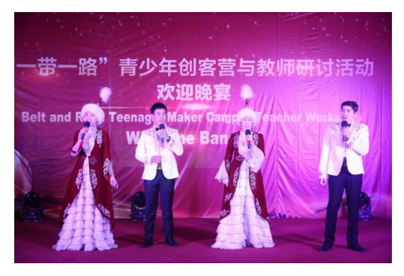
Cultural show performed by each delegation during the welcoming dinner

Welcome and we are looking forward to your participation in the future.